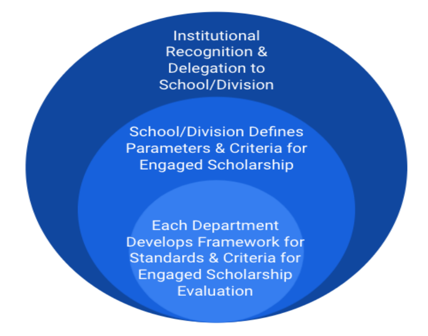
Figure 4. Decentralized Criteria within an Institutional Framework

The third model (see Figure 4) is built on Decentralized Criteria within an Institutional Framework. This can happen when the institution itself adopts a broad policy that recognizes engaged scholarship and then delegates the task of defining the parameters and characteristics of engaged scholarship to each constituent school or division. Then, each department is tasked to articulate a framework of standards and criteria for evaluating engaged scholarship for its academic personnel review. In this model, engaged scholarship is clearly recognized institutionally, while allowing the specific fields to define the particular characteristics of engaged work. Engaged scholarship is treated as part of the research and teaching output as appropriate to a faculty member's field. An engaged scholar coming up for review in a particular department would know exactly what the criteria will be for the evaluation of their work within that department, at the dean's level, and at the academic senate level.