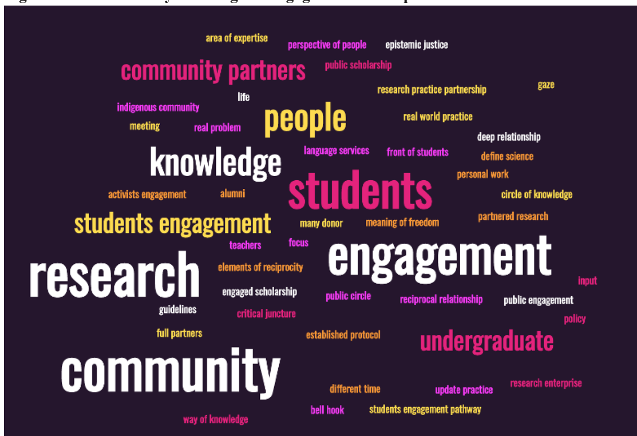
Figure 5. UCLA Faculty Meanings of Engaged Scholarship

Some faculty conveyed that their engaged work is closely associated with public scholarship and the "public circle of knowledge making," including stakeholder-driven work to inform policy, planning, and "grounding science with real world planning." Some faculty described their engaged scholarship as driven by wanting to engage students with real world issues and help them find career paths through public-facing curricula (undergraduate and graduate programs). Figure 5 conveys the keywords used by UCLA faculty to convey their understanding of engaged scholarship.