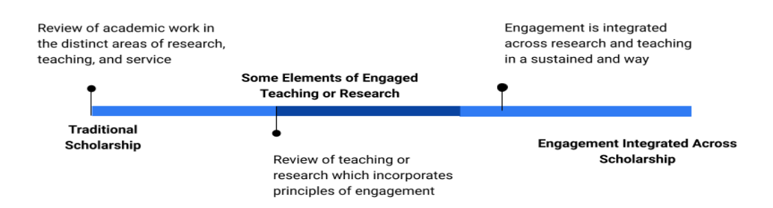
Figure 2. Continuum of Scholarship Model

The second model (Figure 3) is an Opt-in Supplemental Review . In this model, the individual faculty member always undergoes a standard review, and has the option of adding a supplemental review of what they identify as their engaged research and/or teaching. This approach recognizes that engaged scholarship is integrated into the research and teaching output of the faculty member and needs attention by peer reviewers who are familiar with the standards and criteria for excellence; however, this approach places that review outside of the standard review.